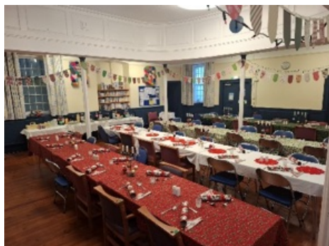
The Room Set Out