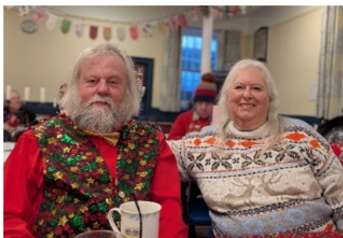
Two Satisfied Guests