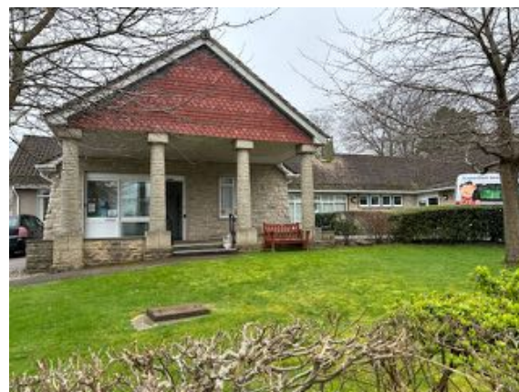
The Day Centre