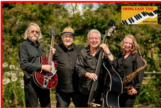
LIVE MUSIC: SWING EASY TOO (4-piece band, vocalists) plus Guests

(Music Unlimited for Swanage Independent Charities)