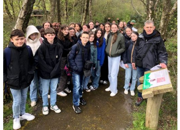
The museum recently welcomed more than 50 students and teachers from a French college.

The museum is expecting to host many other school groups from across the UK and overseas during 2024, given the high level of interest in Dorset's natural and industrial heritage. Such group visits are dependent, however, on having enough visitor reception guides at the museum which is run entirely by volunteers. If you are interested in joining the friendly group of volunteers just visit http://purbeckminingmuseum.org/contact-us/ to find out more.