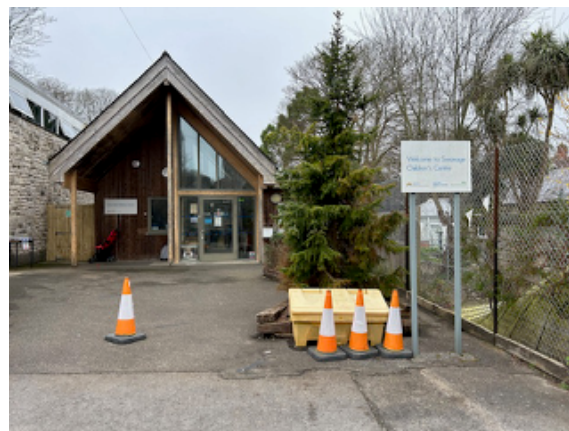
The Children's Centre

Swanage and Purbeck Development Trust 19 April 2024