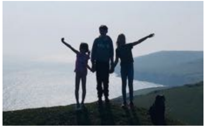
Children enjoying the coast