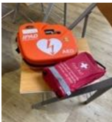
The recovered defibrillator